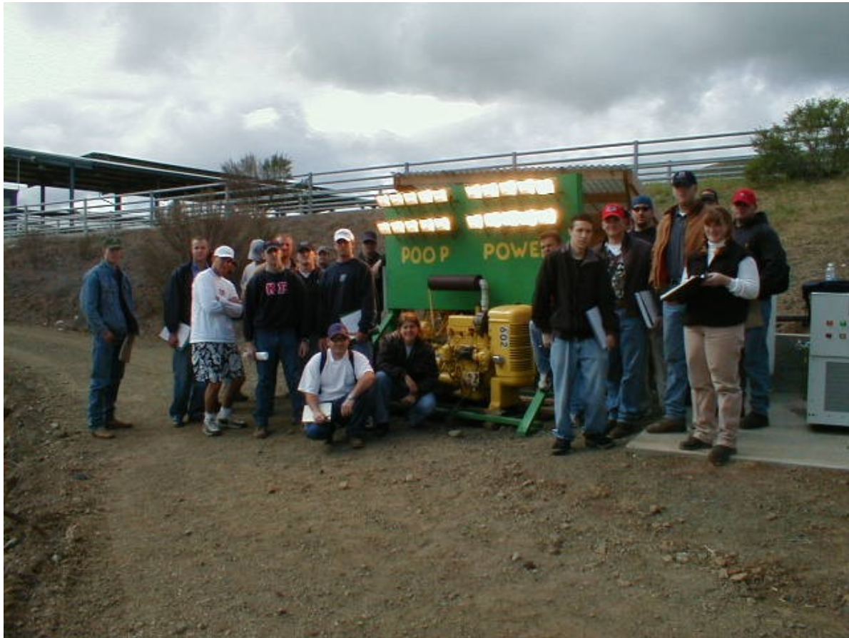
Figure 4: 10 KW Engine-Generator Test