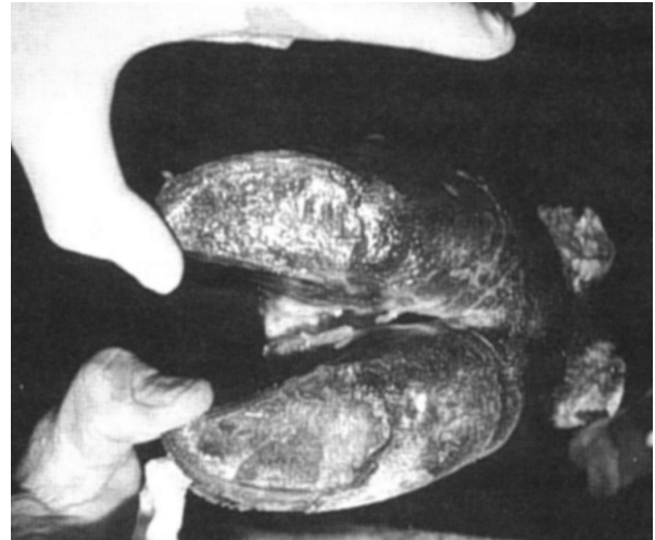
Figure 1. Foot rot in a cow showing separation of the interdigital skin, revealing a whitish-yellow necrotic core-like material.

Feet infected with F. necrophorum serve as the source of infection for other cattle by contaminating the environment. Disagreement exists on the length of time F. necrophorum can survive off of the animal, but estimates range from one to ten months. Once loss of skin integrity occurs, bacteria gain entrance into subcutaneous tissues and begin rapid multiplication and production of toxins that stimulate further continued bacterial multiplication and penetration of infection into the deeper structures of the foot.