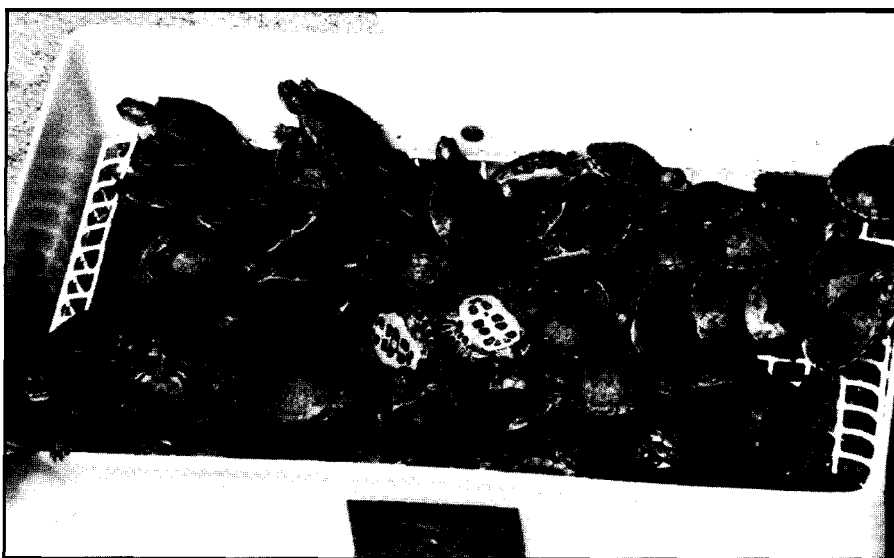
Hatchlings.

The techniques developed for producing baby red-ear sliders have been adapted in recent years to other turtle species as well. Baby snapping ( Macrolemys sp., Chelydra sp.) and softshell ( Apalone sp.) turtles are familiar examples, but many other species are also becoming available commercially. With the help of the Internet, marketing efforts are beginning to pay off for some turtle producers and exporters. Overall, turtle production is becoming more standardized and professional.