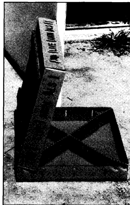
Box for shipping pet turtles.

Current export markets for baby pet turtles show little sign of dramatic expansion over the next