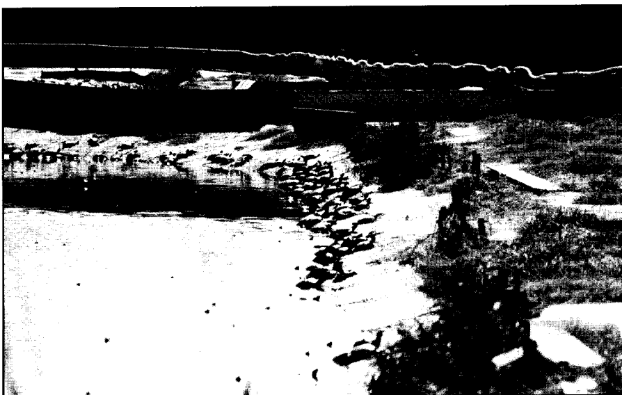
Turtles leave pond to nest.

Eggs are initially washed for 5 to 10 minutes at 95 to 100 °F (35 to 38 °C) with a dilute chlorine solution made by adding 3 to 4 teaspoons of fresh commercial chlorine bleach to 1 gallon of clean water (4 to 5 ml of bleach per liter of water). Eggs are usually washed in machines developed for the poultry industry. Then they are thoroughly rinsed and dried. The next step is to infuse the developing eggs with antibiotics to prevent any salmonella infections from progressing. An antibiotic such as Garasol® (gentamicin) is used as a dip solution (1000 ppm gentamicin) in a vacuum chamber. Suitable chambers are available from a variety of commercial suppliers. Egg baskets are immersed in the solution and the chamber sealed. A 25- to 27-inch (63- to 69-cm) vacuum is held for 5 minutes, then released slow-