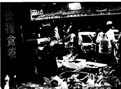
Figure 2. Dressed bighead carp in a Chinese market.

Most live bighead are sold from small street markets clustered within a particular area (Fig. 2). Competition is fierce and the typical vendor might sell only 100 to 500 pounds of bighead each day. Because space is limited and the value of dead fish is so low, retailers buy only what they can sell in a day or two. The typical markets are not accessible to large transport trucks, so fish must be warehoused and distributed to individual fish markets by smaller trucks (Fig. 3). Another difficulty is that retailers often want to see the quality of the fish before they buy. Bighead are not easy to keep alive in small tanks, especially at market size. If a wholesaler is unable to market fish within a few days of receiving them, they are likely to die. Therefore, it is critical for producers, haulers, wholesalers and retailers to understand the importance of minimizing stress on the fish at each point of han-