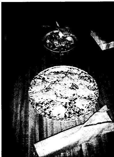
Figure 4. Canned bighead carp.

ed that canned bighead is well accepted by consumers, as the canning process softens and eliminates bones. In one study, more than 60 percent of the taste test panelists felt that products made with bighead were equal to or better than canned tuna, and said they would pay a similar price. Processed meat is bland, light in color, low fat (less than 1 percent crude lipids), and relatively soft. Texture could be improved by