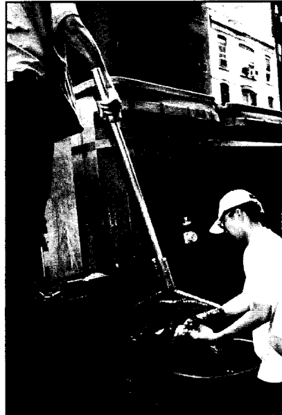
Figure 3. Unloading live bighead on a crowded city street.

dling. Rough handling and rapid temperature and water quality shifts during hauling and holding are the largest logistical hurdles to overcome, especially in the summer. Transport tanks should be insulated, white fiberglass to stay as cool as possible. Salts are often useful to minimize stress and large blocks of chlorine-free ice can help keep fish cool during transit.