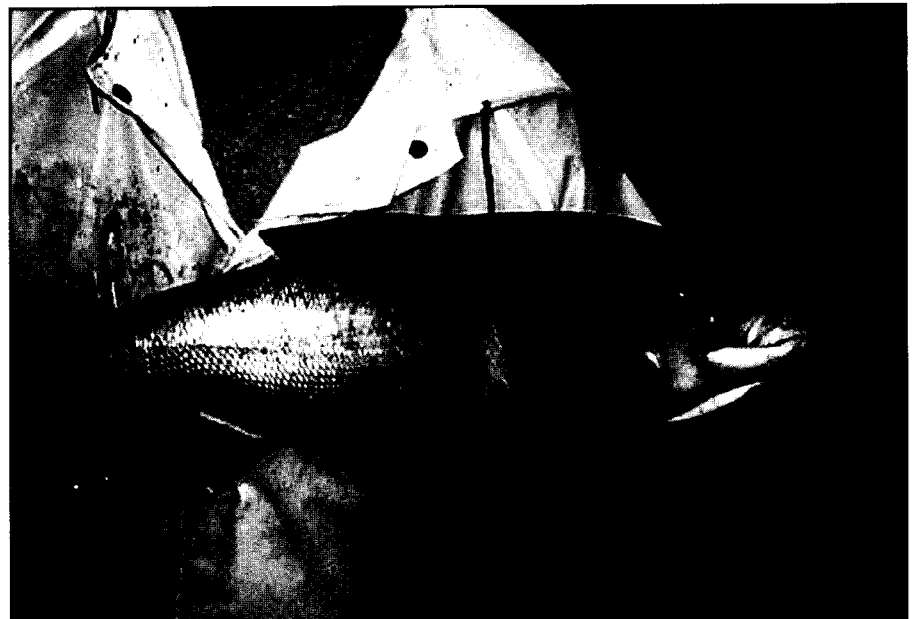
Figure 1. Bighead carp.

The bighead is aptly named, as this fish has a large head with a protruding lower jaw and eyes that “look down” (Fig.1). They are deep-bodied fish with tiny scales and gray to black blotches on the body, which gives them a speckled appearance. While bighead can reach 60 pounds or more and 4-year-old fish may weigh 20 to 25 pounds, the primary market is for 6- to 12-pound fish. Bighead can survive in a wide range of temperatures, but in one study their preferred temperature was 78 °F