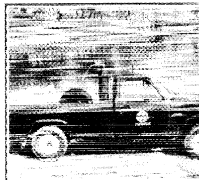
Pickup and tank equipped with oxygen used for fingerling delivery.

More information is needed on optimum hauling temperatures and salinities for different sizes of red drum at various loading densities. Acclimation rates for different conditions also need further evaluation.