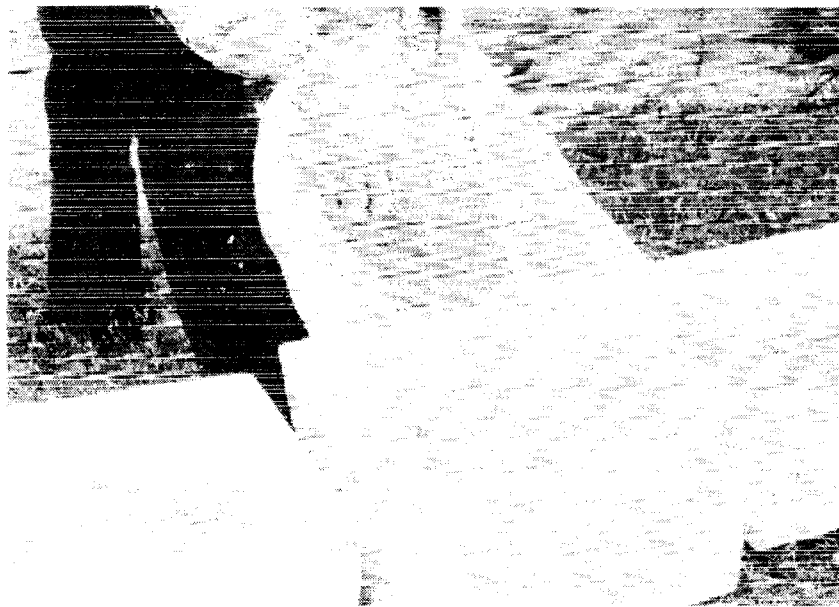
Figure 1. These are typical plastic bags and styrofoam boxes used for transporting small fish. Water temperature must be adjusted before adding fish, and oxygen must be added before transporting.

Table 3 provides guidelines for transporting bluegill at temperatures between 65° and 80° F and up to 16 hours. Bluegill are normally hauled with 0.3 to 0.5 percent salt.