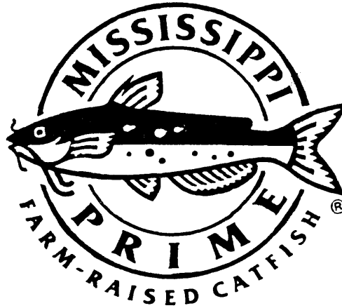
Figure 2. The Catfish Institute's Mississippi Prime logo.

In early 1988 The Catfish Institute (TCI), in cooperation with the USDC and the NMFS, began a voluntary inspection program to insure and promote quality catfish products. Processors who meet the criteria set by this program are able to use TCI'S registered trademarks, the Mississippi Prime name and logo (Figure 2), on their catfish products. To be able to use these trademarks, a processor must be licensed by TCI and can process only grain-fed channel catfish delivered live to the plant. The plant must be USDC certified as a "Sanitarily Inspected Fish Establishment". Weekly inspections to maintain this certification are required. In addition, weekly unannounced lot inspections by USDC are mandatory. "Evaluation of the