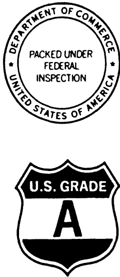
Figure 1. The Federal inspection mark (top); the U.S. grade shield.

Standards for Fish Plants, FED-STD-369, August 2, 1977. Additional information regarding inspection and standards for products is in the Code of Federal Regulations Title 50, parts 260 and 267. Figure 1 is an example of the Inspection Mark and the Grade Shield that would be displayed on catfish products that meet specific requirements. Products may have one or both of these symbols, depending upon the degree of inspection effort performed and the grade of the product.