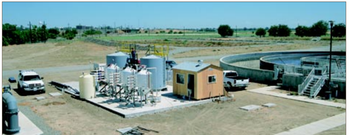
At UC Davis, a pilot plant is under construction of the APS-Digester, which converts animal manure and plant waste into biogas under anaerobic conditions. The first commercial application will be at a Florida racetrack, but it has broad applications for dairy, swine, poultry and other animal operations.